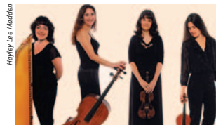
The Brook Street Band