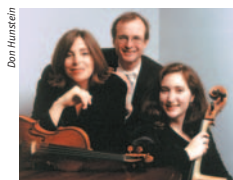
Gould Piano Trio

£10 including programme &amp; coffee/sherry/juice