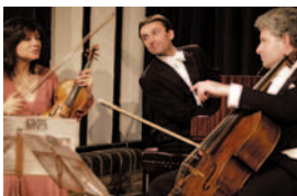
Barbican Piano Trio