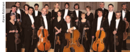
Academy of St Martin in the Fields